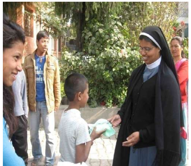
Distribution of oral hygiene materials

The program is ended with distribution of oral hygiene material consisting tooth paste, tooth brush, soap, and napkin.