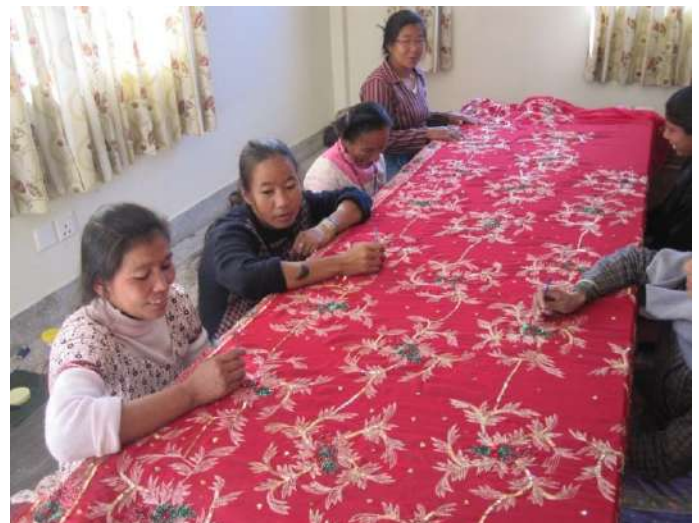
Embroidering work by in-housed clients