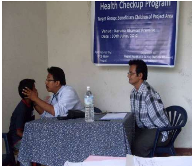
Medical screening of Child

The 2nd event, an oral health checkup program was organized for monitoring oral health status of the beneficiary children.