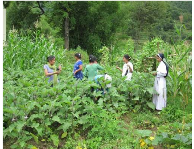
Vegetable Gardening at Karunabhawan