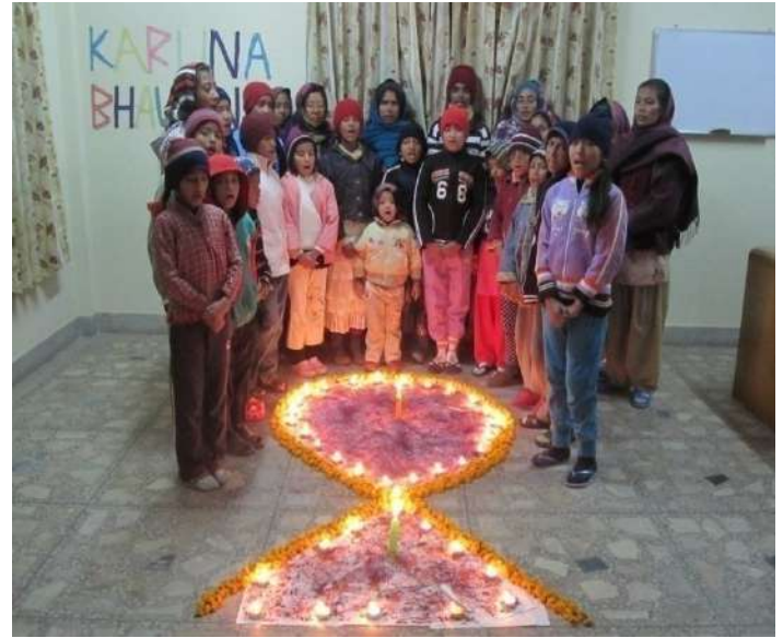
World AIDS Day at Karuna Bhawan

In the year 2012-13 Karuna Bhawan had conducted a special prayer service and gathering of former inmates on the occasion of WORLD AIDS DAY. After the prayer service a candle lighting ceremony organized to honor the people living with HIV/AIDS and those who have died due to the infection. On Dec. 25th 2012 a gathering with our old inmates was organized on the occasion of Christmas and they spent a good time with Karuna Bhawan family.