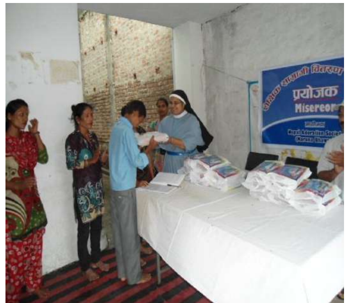
Educational material support

All 20 children were promoted to next class with good performance.