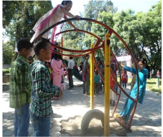
Children enjoying swing in central zoo

They saw tiger, lion, Worgan Wotang, wild cats, dear, elephant, crocodile, tortoise, different types of birds, fishes. All children were very much interested to know about these animals. Children also enjoyed different types of swings and slider with a great fun in children's park inside the zoo.