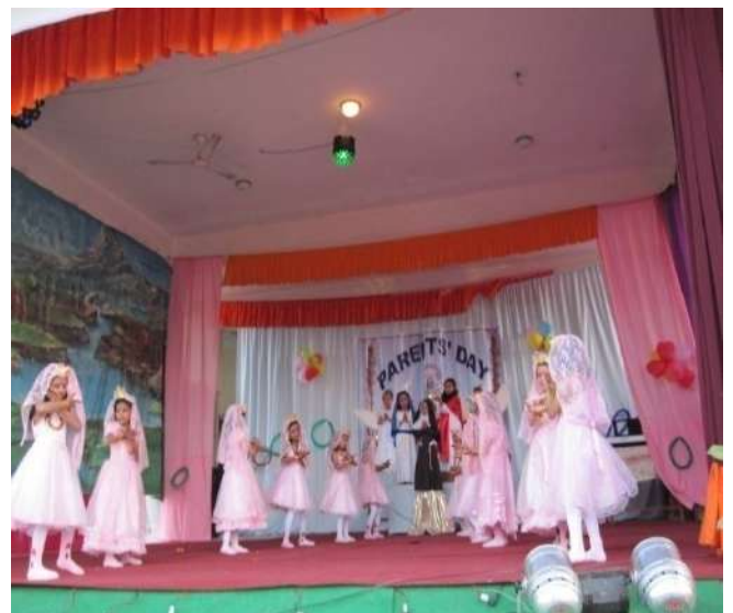
Students performing Dance on Parents Day